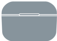
Charging case x 1