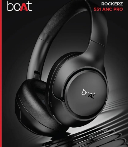
ROCKERZ 551 ANC PRO