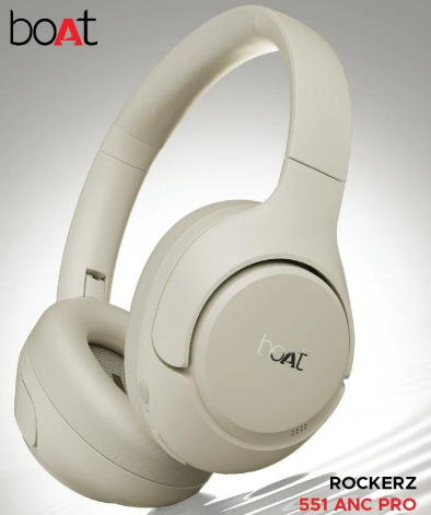
ROCKERZ 551 ANC PRO