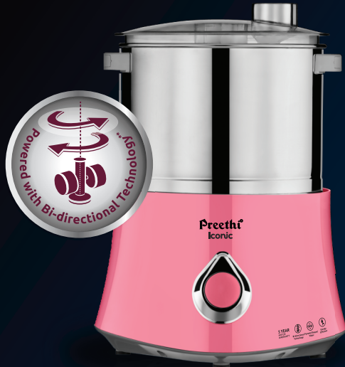
Iconic Model No.: WG908