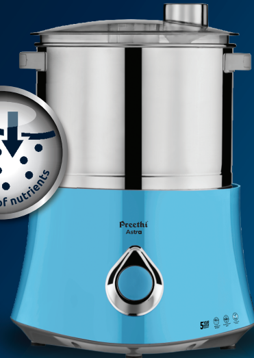
Astra Model No.: WG909