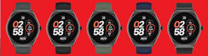
LUNAR SEEK USER MANUAL

Allow this manual to guide you through the functioning of your smartwatch. Please read it thoroughly before using it for a smooth sail. You may refer to these instructions for later use as well.