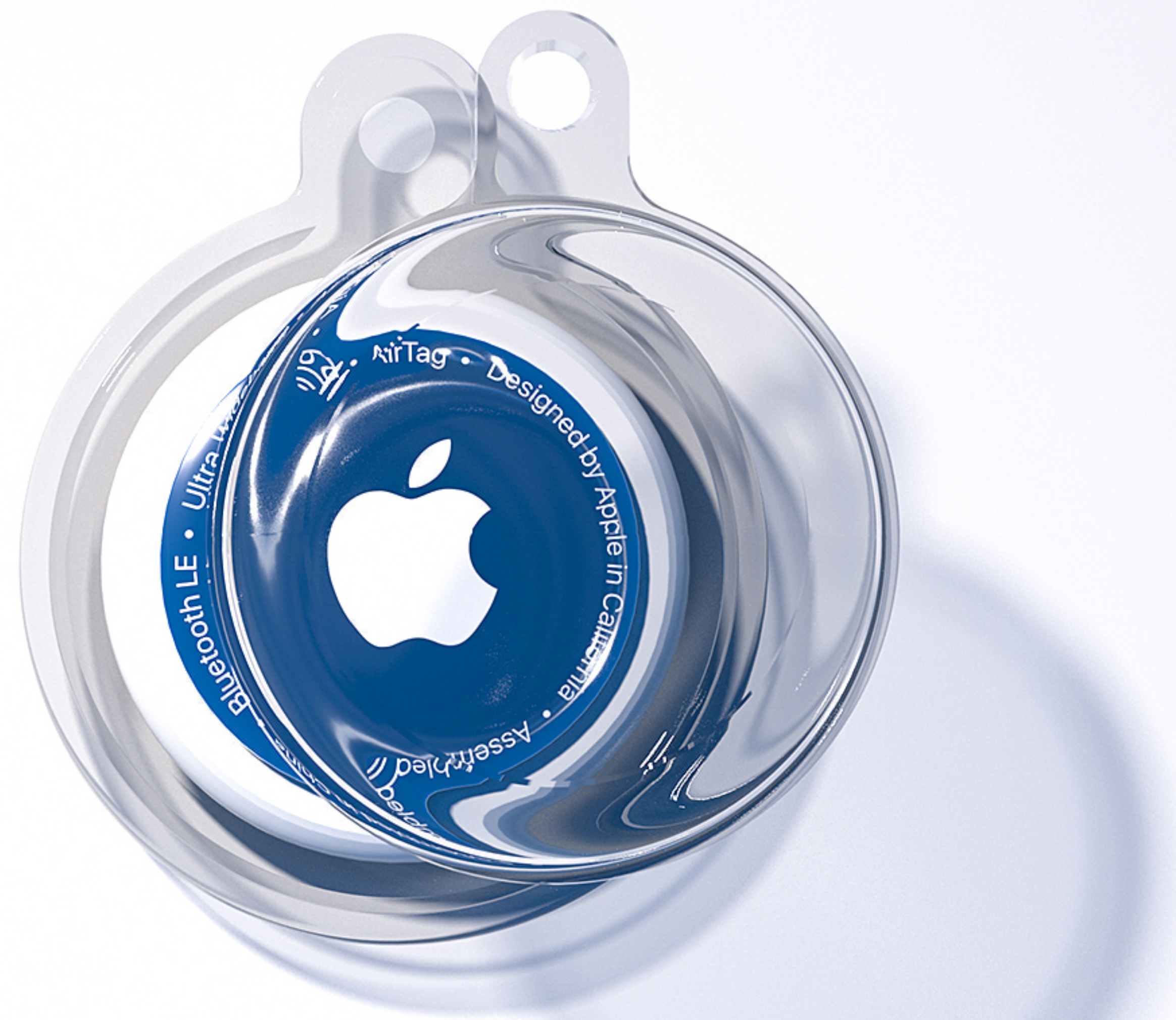
STEP 2 INSTALL THE AIRTAG INTO THE CASE