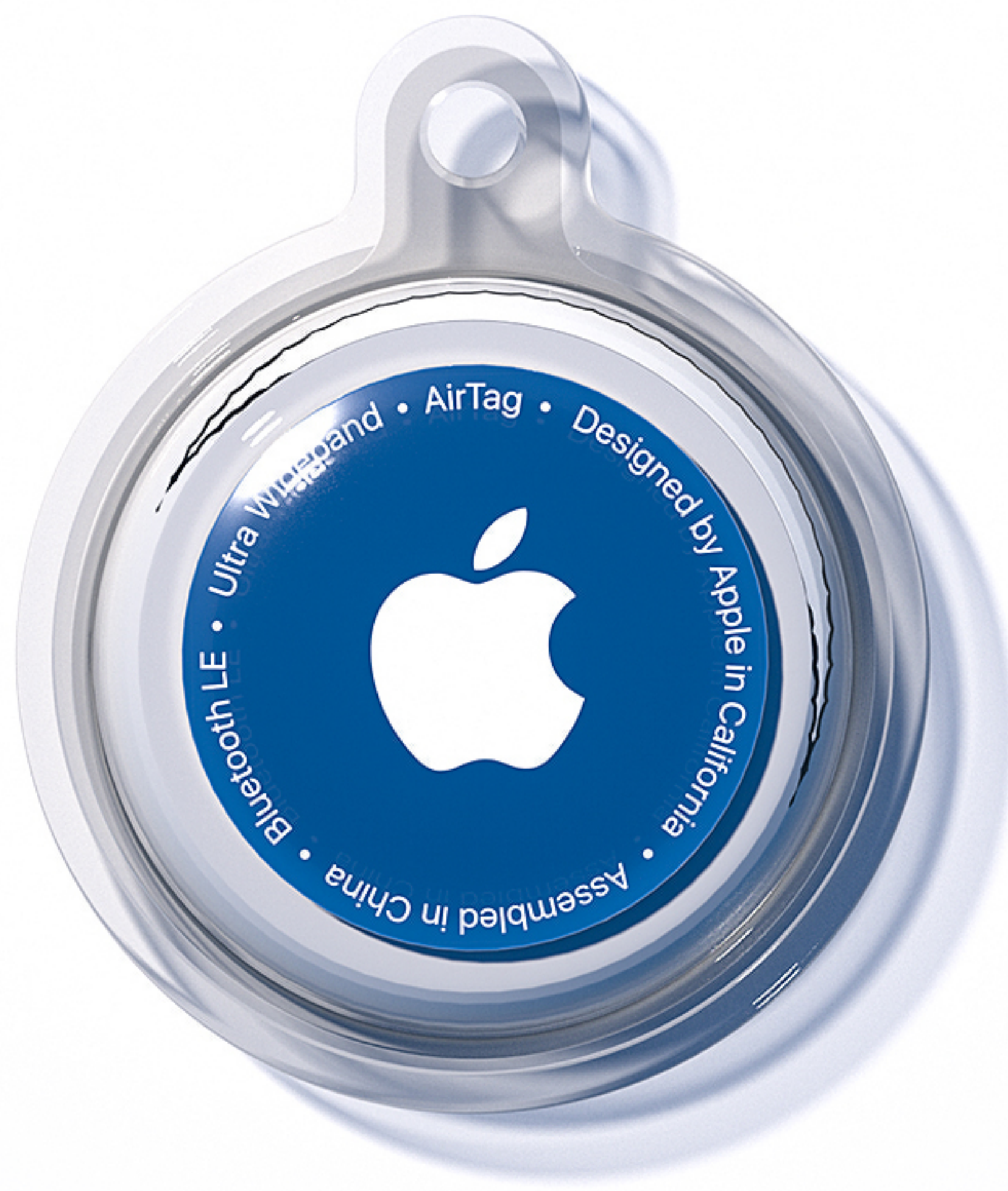
STEP 3 PRESS A CIRCLE AROUND FROM THE TOP GROOVE TO ENSURE COMPLETE CLOSURE