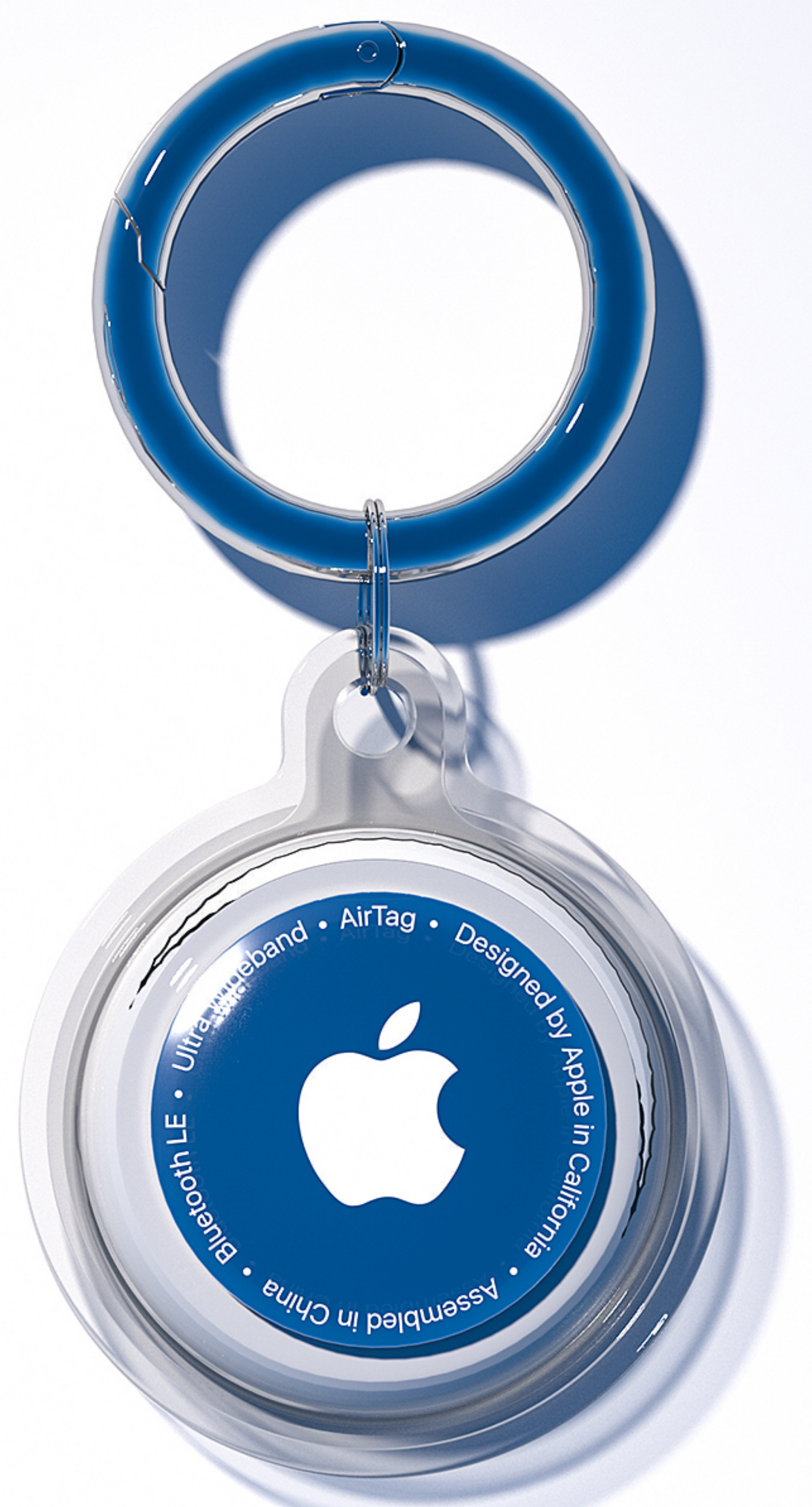
PUT THE KEYCHAIN ON THE HOLDER SNAP KEYCHAIN AND SMALL RING CAN BE COMBINED AT WILL