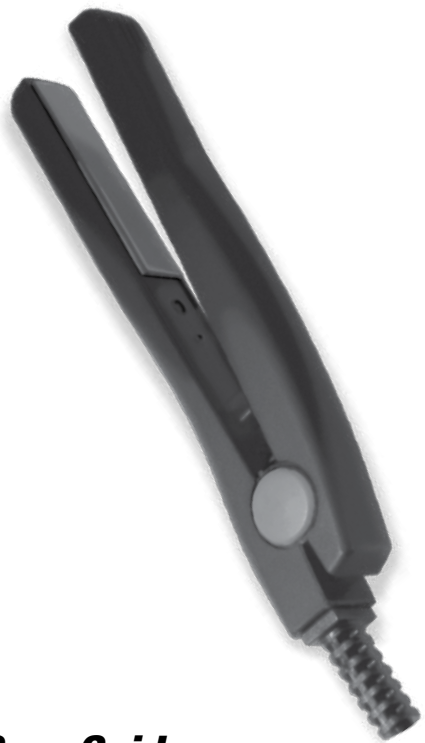
Mini Flat iron S-2880