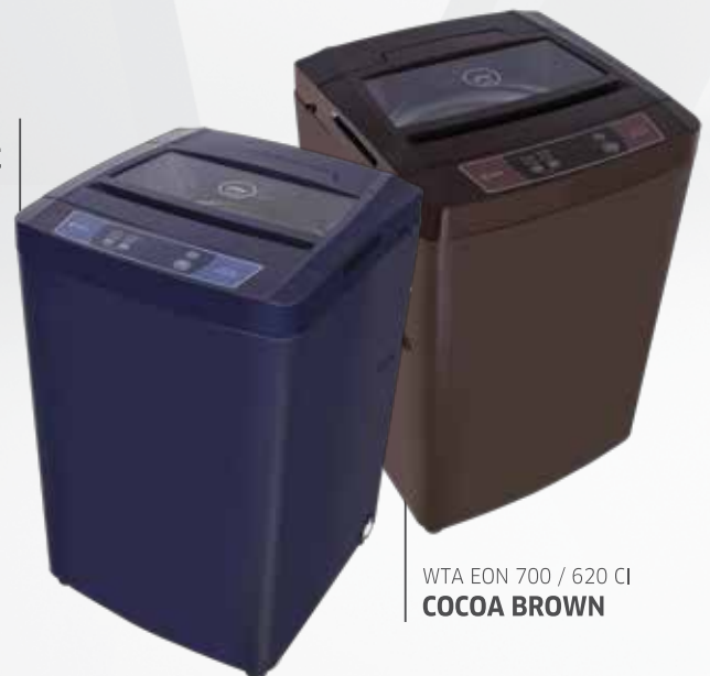
WTA EON 700 / 620 CI COCOA BROWN

i-Wash Technology | 5 Wash Programs | Stainless Steel Inner Tub | Scratch-proof Toughened Glass Lid | Memory Backup With Auto Restart | Child Lock | Active Soak Colours Available: Indigo Blue, Cocoa Brown