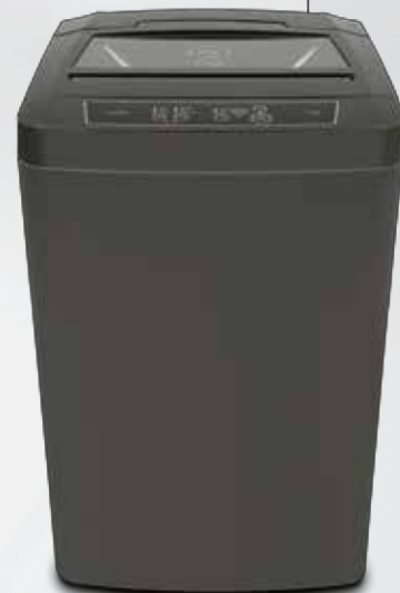
WT EON AUDRA 700 PDNMP

Stainless Steel Wash Tub | Scratch-proof Toughened Glass Lid | Memory Backup with Auto Restart Colour Available: Royal Grey