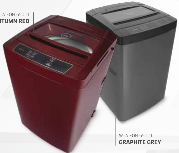
WTA EON 650 CI GRAPHITE GREY

i-Wash Technology | 5 Wash Programs | Stainless Steel Inner Tub | Scratch-proof Toughened Glass Lid | Memory Backup With Auto Restart | Child Lock | Active Soak Colours Available: Graphite Grey, Autumn Red.