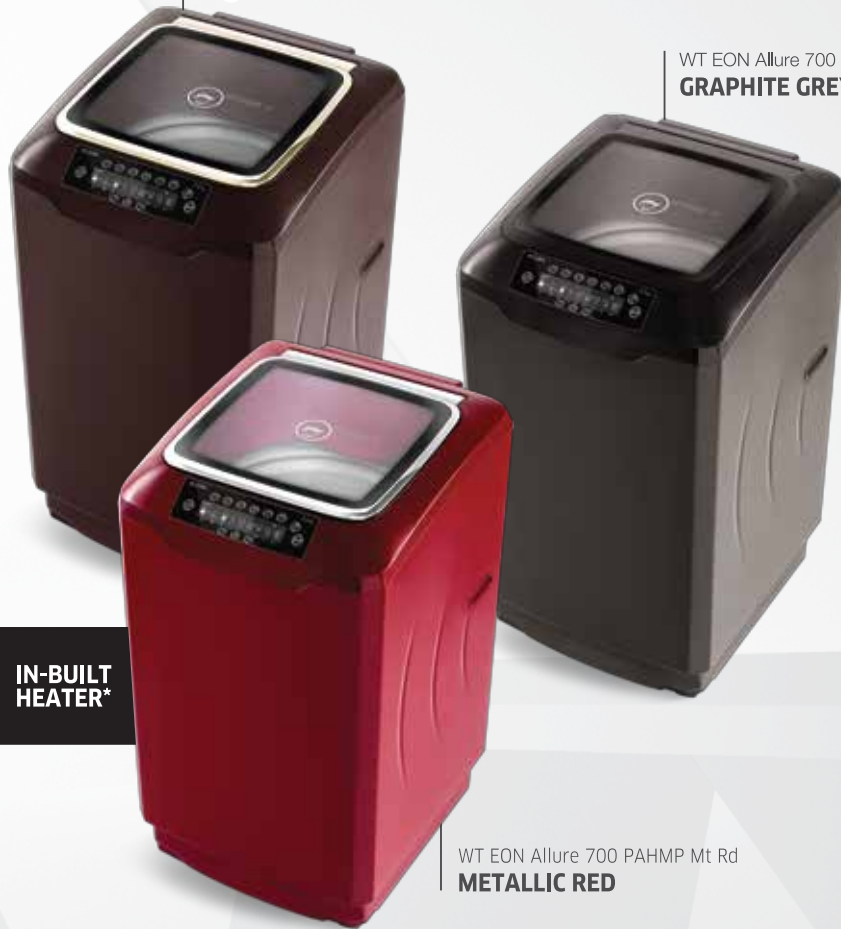
WT EON Allure 700 PANMP Gp Gr GRAPHITE GREY