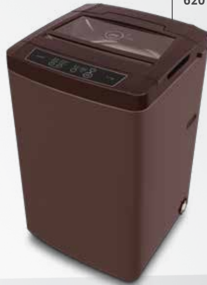
WT EON AUDRA 620 PDNMP

Stainless Steel Wash Tub | Scratch-proof Toughened Glass Lid | Memory Backup with Auto Restart Colour Available: Cocoa Brown