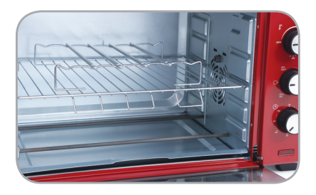
Slide the rack in place inside the oven.

Skewer the food and place the skewer rods on the skewer rack.