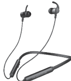
BassBand Wireless Earphone